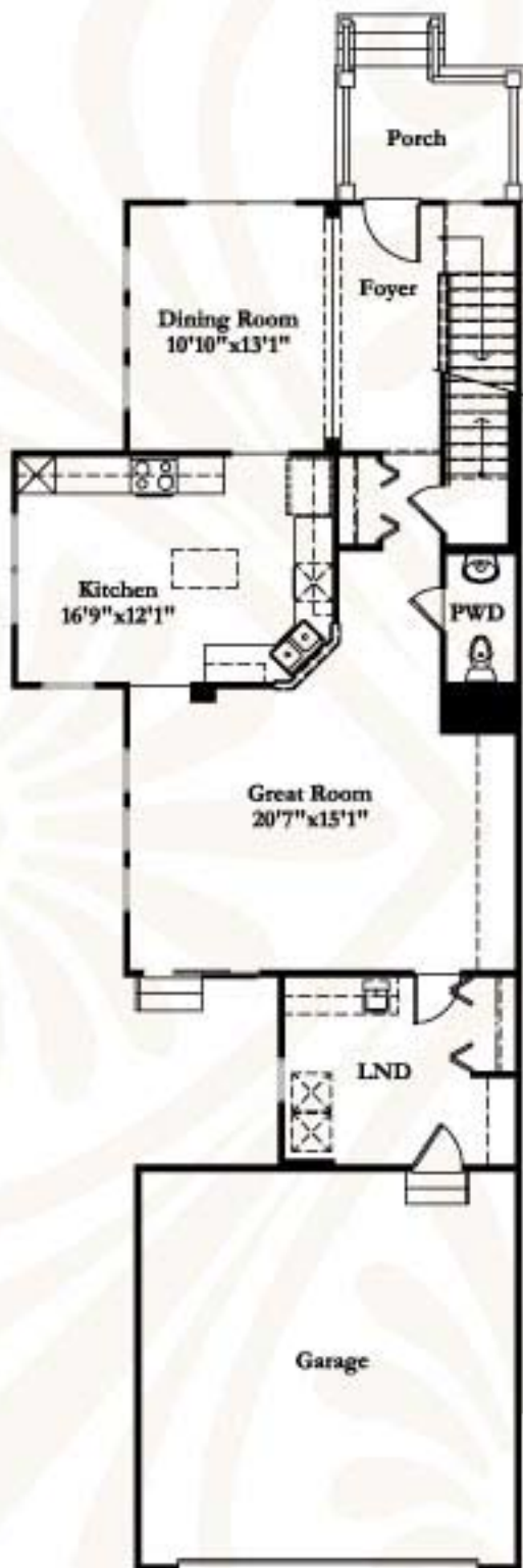
Standard First Floor